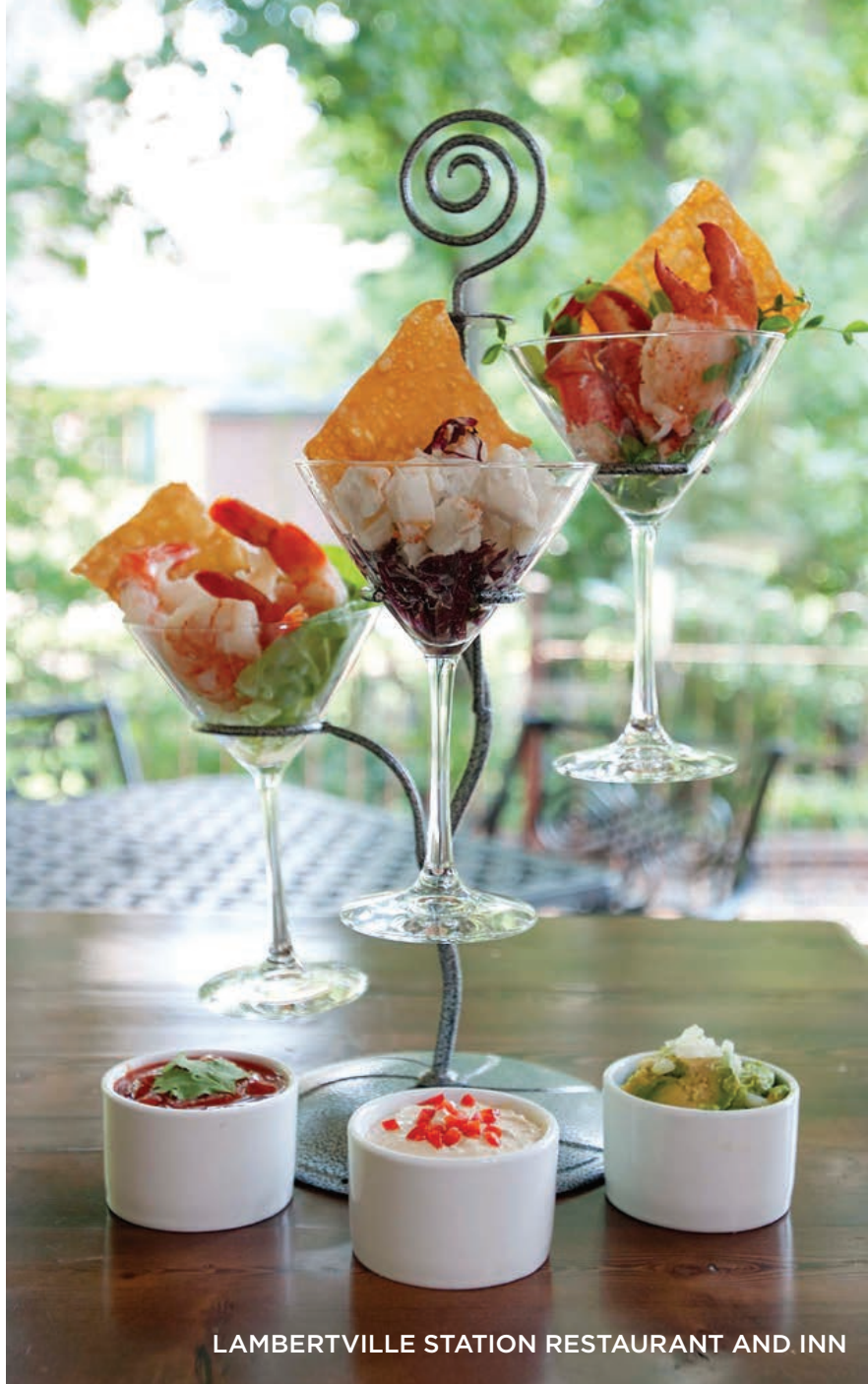
LAMBERTVILLE STATION RESTAURANT AND INN

royalcoachman.com | 800.472.7433 Runners-Up » AAA Limousine; AAA Worldwide Transportation